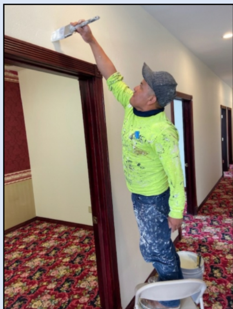
Left: Touching up. Gotta be perfect!