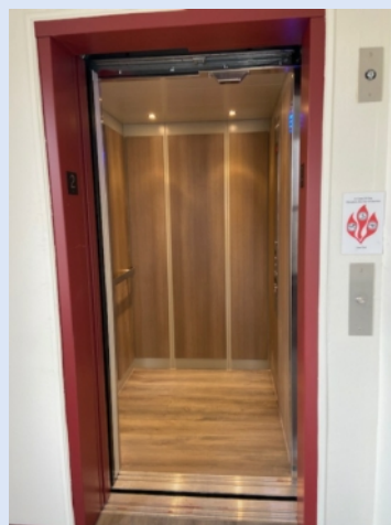
...where you'll immediately see our spiffy new elevator.