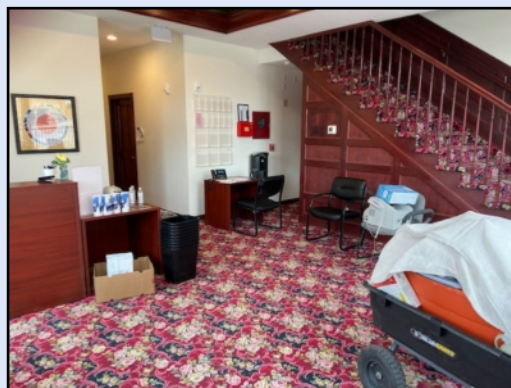
Reception restored. Moving in, almost ready for action!