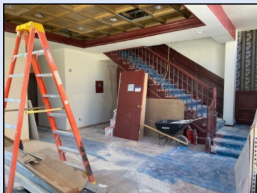
Reception. Gutted, ready for a serious overhaul.