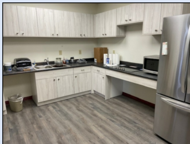
Whooo-eee! I could get used to hangin' out here!