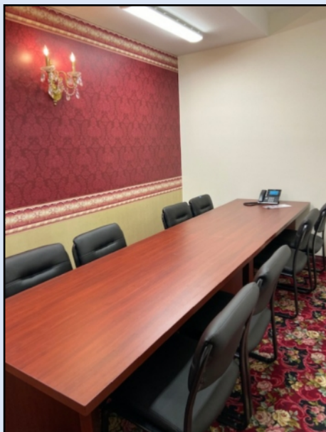
Our smaller conference room for more intimate meetings.