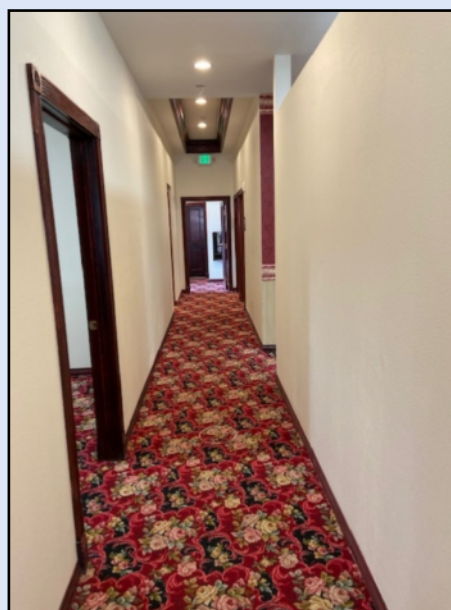
Right: What used to be a casino's open floor space is now a series of private offices.