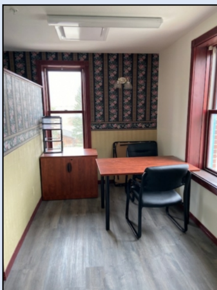
A Willow Bends...one of our resident partner agencies. A secluded spot at rear of building for drug testing. And just a couple steps away from a bathroom.