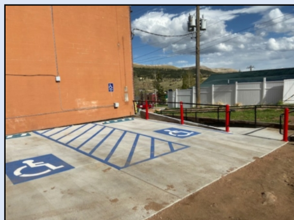
Handicap parking right next to our building. Easy access to a safety-fenced ramp takes you right to our back door...