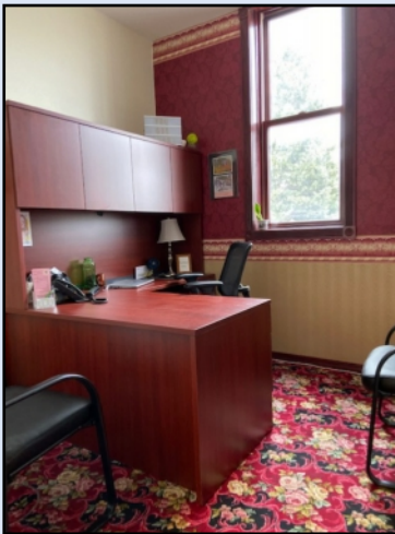
WOW! Looks even better with furniture!