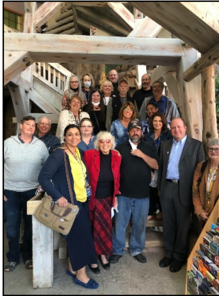
Gov. Polis chats with AMC staff and volunteers as he tours our facility.

It was a rewarding and fruitful afternoon, enjoyed by all.