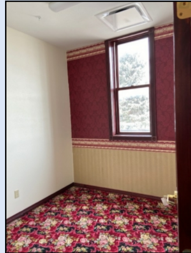
A ready-to-move-in office, with a delightful view of the park.