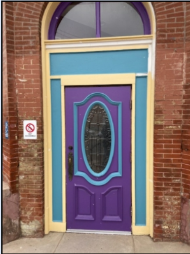
When you open a door as artistic as this one, you just know what's inside has gotta be good.