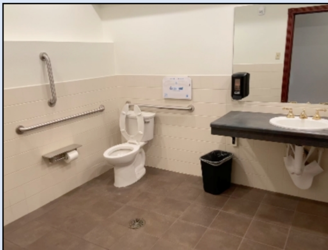
Speaking of bathrooms, all of ours pretty much look like this one. Nice. ADA compliant, too.