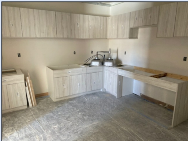
Staff kitchen & break room. A bit rough yet, but let's see what happens.