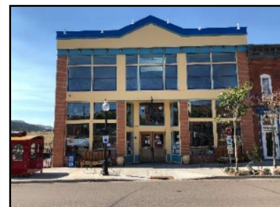
...In with the new.