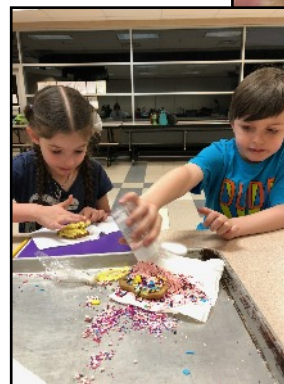
Hey! We need more sprinkles over here!!