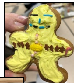
Budding Picasso meets baked goods.